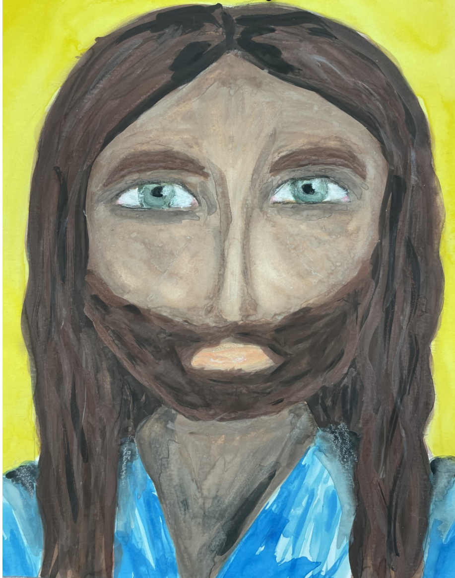
Divine Savior Artwork