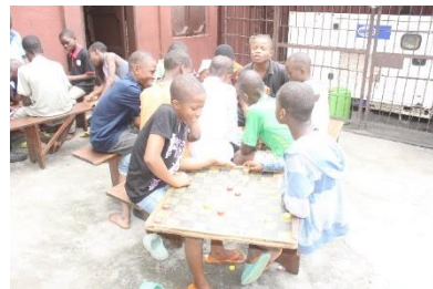
Time for indoor games