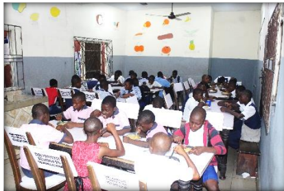
Some children having breakfast