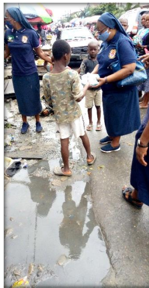
Feeding in the street