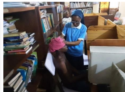
Drop-in beneficiary receiving First-aid treatment