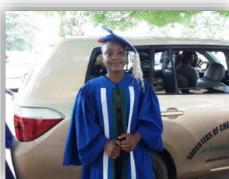
Beneficiary's Matriculation At Rivers State University