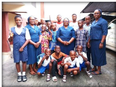
Sisters and some Children