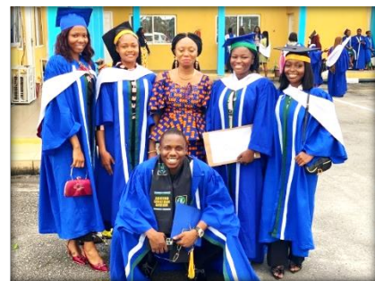
Beneficiary's Graduation in Nursing At Rivers State University