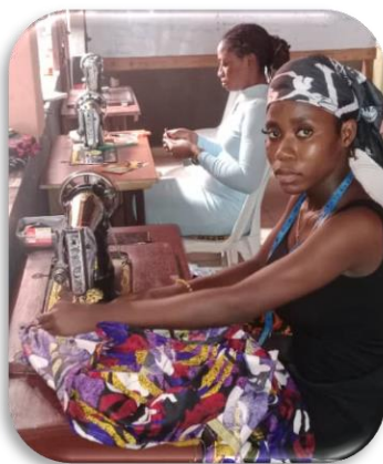
Training in Tailoring