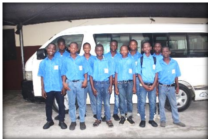
Twelve of our children at the Craft Centre, Ready for school